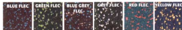
RubberDeck Roll-Out mats color choices.