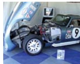
TempoTile, all-purpose flooring, snaps together without tools. Suitable for garages, utility rooms, and displays – TempoTile's array of colors and styles allow the user to create hundreds of different floor designs.