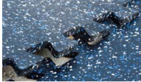
Precision cutting and zipper-like interlocking tabs combine to create a seamless floor.