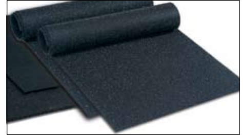
RK2 roll-out mats are anti-fatigue, shock and sound absorbent.

Heavy duty, interlocking rubber tiles and roll-out mats for cushioned support